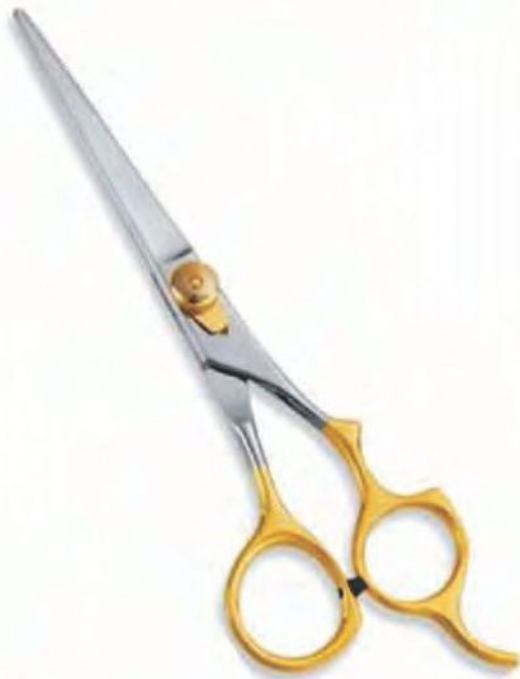
Professional Hair Cutting Scissor Gold Plated Size: 5", 5.5", 6", 6.5"