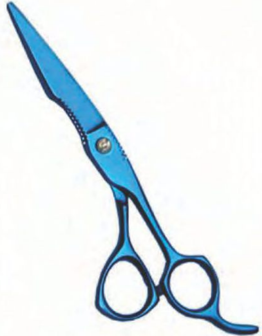
Professional Hair Cutting Scissor Titanium Coated Size: 5", 5.5", 6", 6.5"