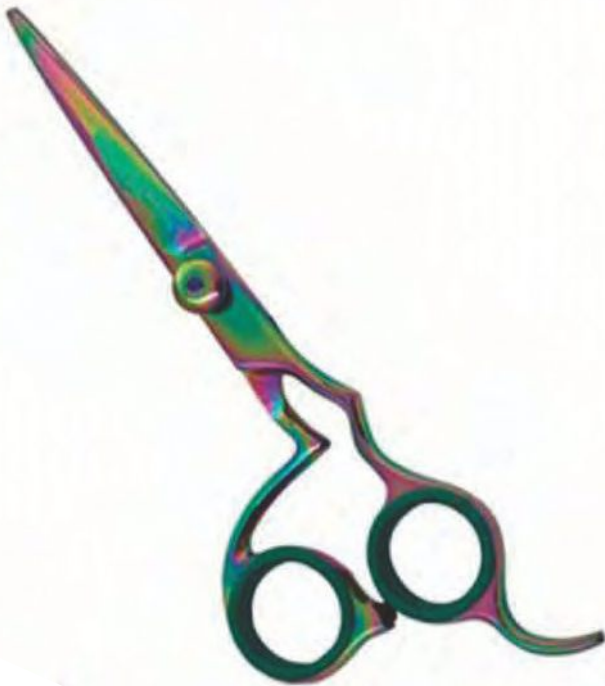
Professional Hair Cutting Scissor Multi Colored Size: 5", 5.5", 6", 6.5"