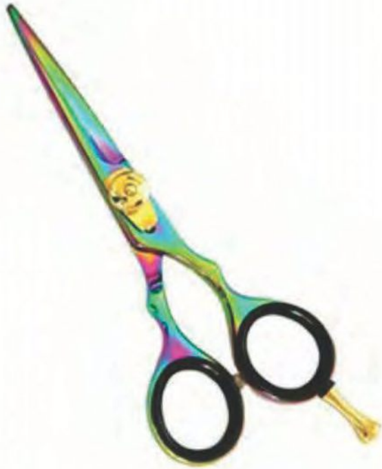
Professional Hair Cutting Scissor Multi Colored Size: 5", 5.5", 6", 6.5"