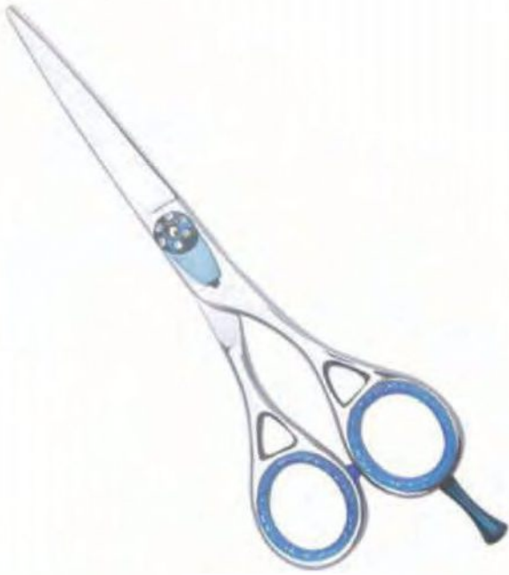
Professional Hair Cutting Scissor Size: 5", 5.5", 6", 6.5"