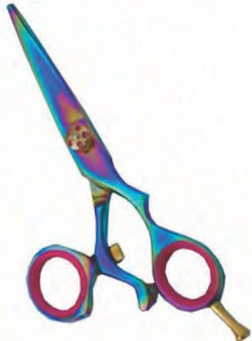
Revolving Thumb Hair Cutting Scissor Multi Colored Size: 5", 5.5", 6", 6.5"