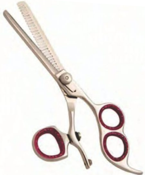
Revolving Thumb Hair Cutting Scissor with Three Finger Holes Size: 5", 5.5", 6", 6.5"