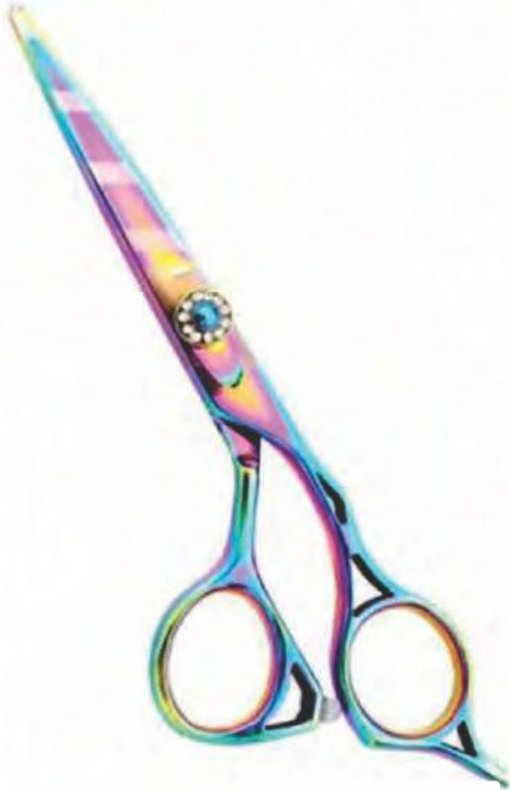
Professional Hair Cutting Scissor Multi Colored Size: 5", 5.5", 6", 6.5"