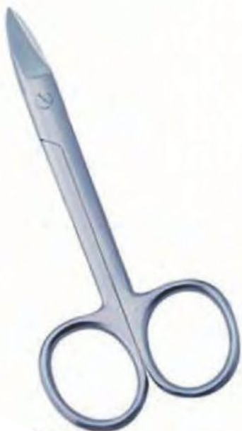
Toe Nail Scissor Size: 9cm