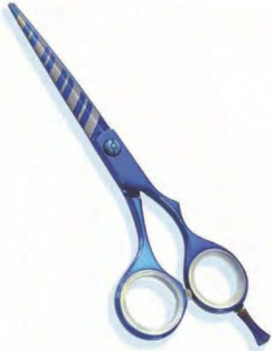
Professional Hair Cutting Scissor Coated Paper Size: 5", 5.5", 6", 6.5"