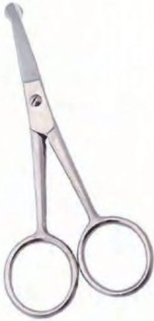
Safety Scissor Size: 9cm