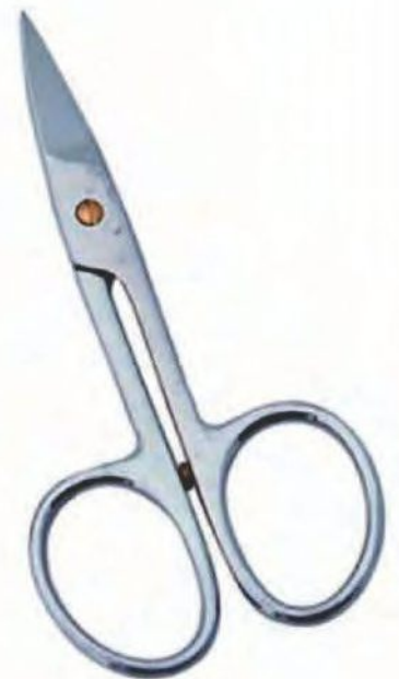
Cuticle Scissor Size: 9cm