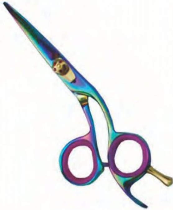
Professional Hair Cutting Scissor Multi Colored Size: 5", 5.5", 6", 6.5"