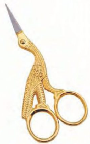
Fancy Cuticle Scissor Size: 9cm