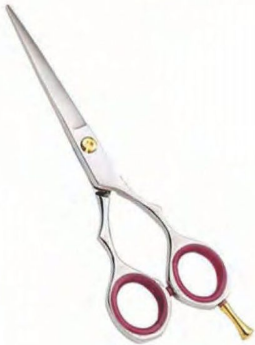
Professional Hair Cutting Scissor Size: 5", 5.5", 6", 6.5"