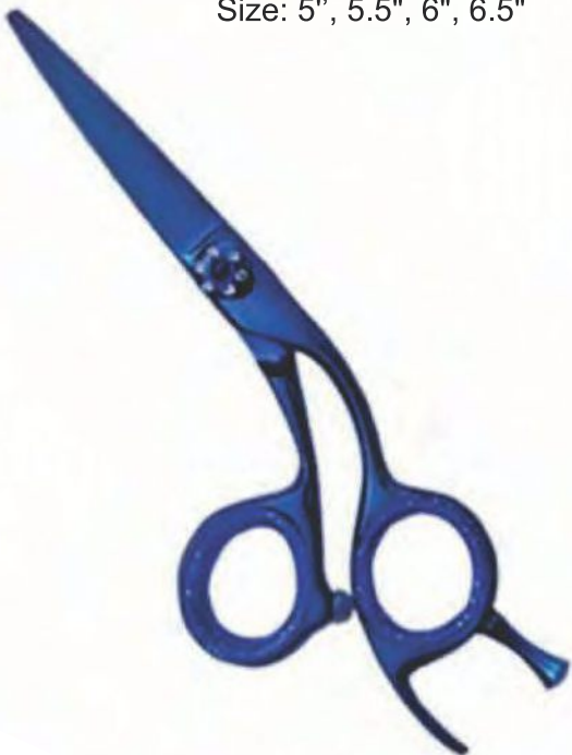
Professional Hair Cutting Scissor Titanium Coated Size: 5", 5.5", 6", 6.5"