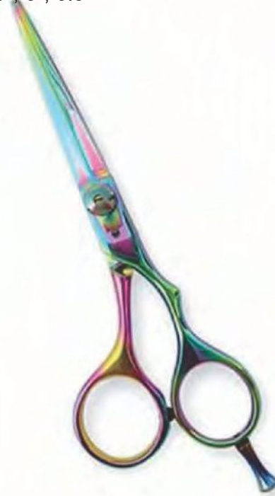
Professional Hair Cutting Scissor Multi Colored Size: 5", 5.5", 6", 6.5"