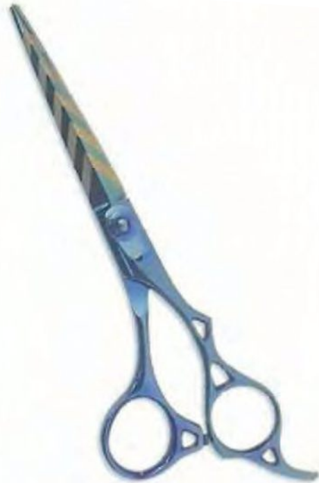
Professional Hair Cutting Scissor Paper Coated Size: 5", 5.5", 6", 6.5"