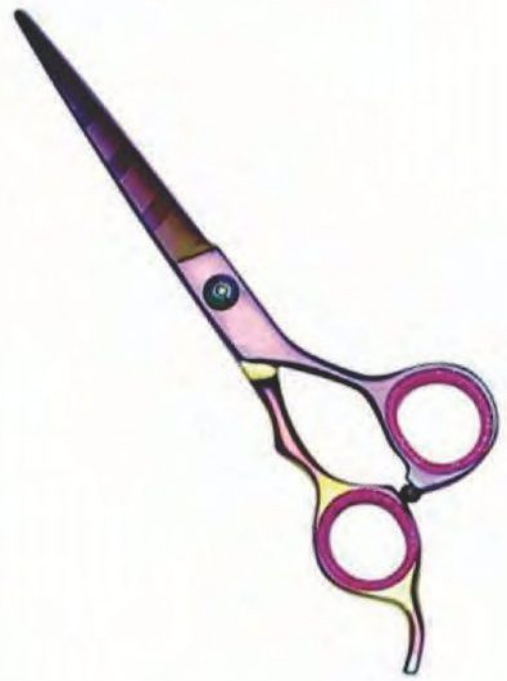
Professional Hair Cutting Scissor Multi Colored Size: 5", 5.5", 6", 6.5"