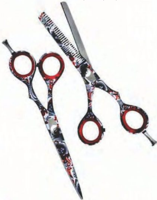
Professional Hair Cutting Scissor Paper Coated Size: 5", 5.5", 6", 6.5"