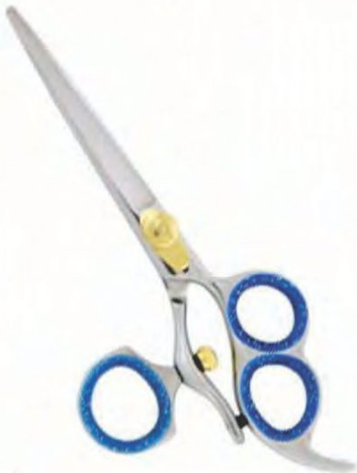
Revolving Thumb Hair Cutting Scissor Size: 5", 5.5", 6", 6.5"