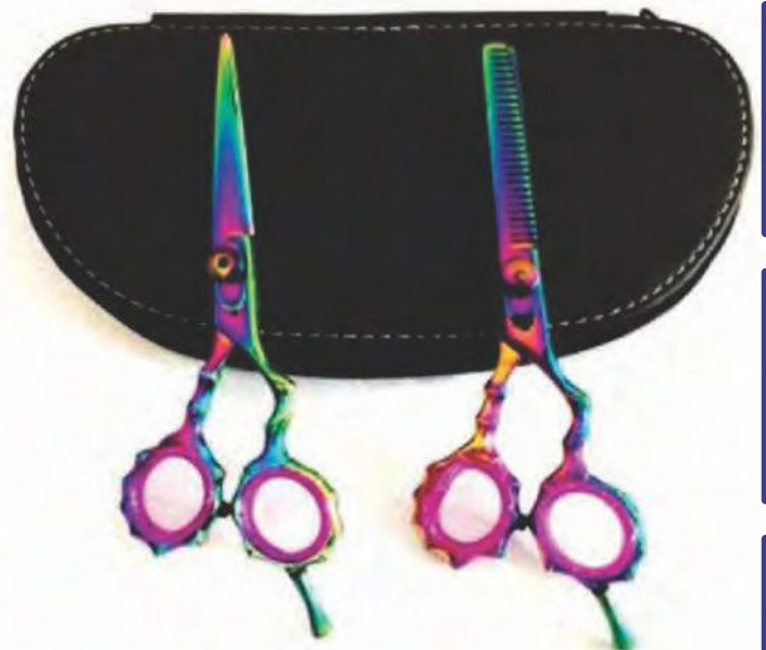
Star Professional Hair Cutting Scissor Multi Colored Size: 5", 5.5", 6", 6.5"