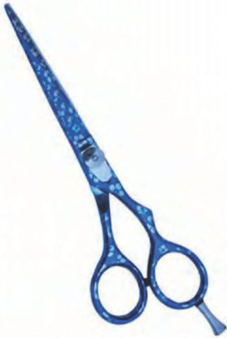
Professional Hair Cutting Scissor Paper Coated Size: 5", 5.5", 6", 6.5"