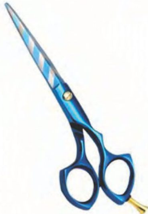
Professional Hair Cutting Scissor Paper Coated Size: 5", 5.5", 6", 6.5"