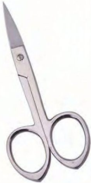
Cuticle Scissor Size: 9cm