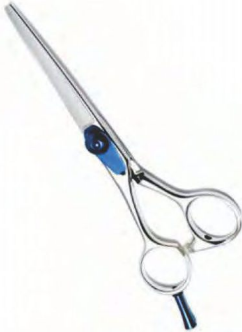
Professional Hair Cutting Scissor Size: 5", 5.5", 6", 6.5"