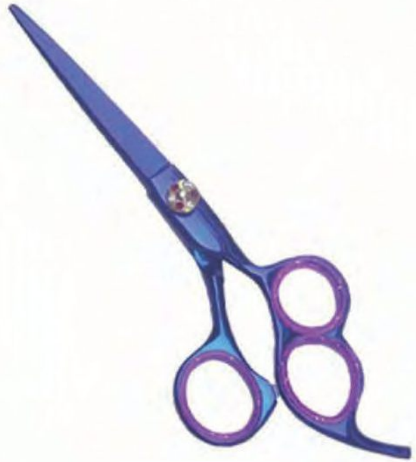
Professional Hair Cutting Scissor with Three Finger Holes Multi Colored Size: 5", 5.5", 6", 6.5"