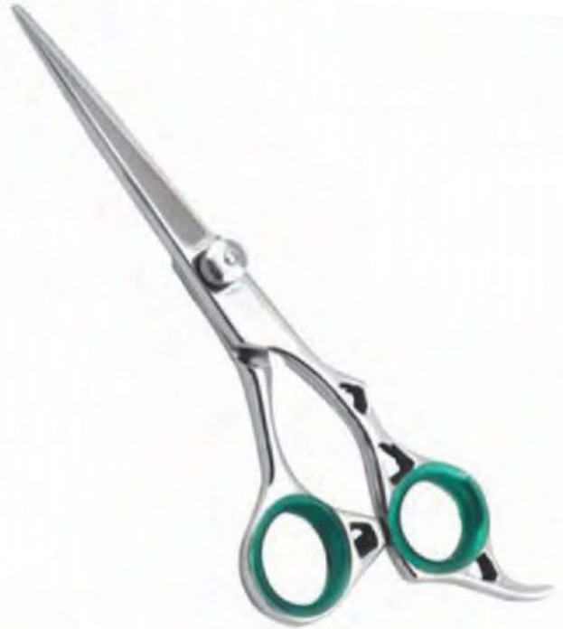
Professional Hair Cutting Scissor Size: 5", 5.5", 6", 6.5"