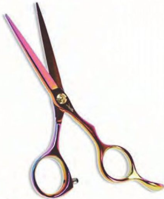
Professional Hair Cutting Scissor Titanium Coated Size: 5", 5.5", 6", 6.5"