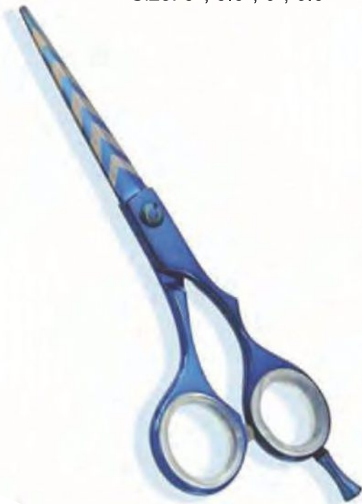
Professional Hair Cutting Scissor Paper Coated Size: 5", 5.5", 6", 6.5"