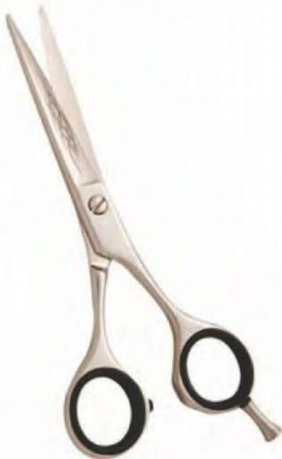
Professional Hair Cutting Scissor Size: 5", 5.5", 6", 6.5"