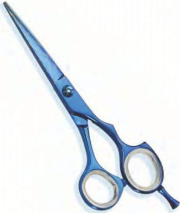
Professional Hair Cutting Scissor Titanium Coated Size: 5", 5.5", 6", 6.5"