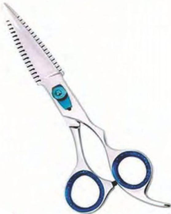
Fish Bone Hair Cutting Scissor Size: 5", 5.5", 6", 6.5"