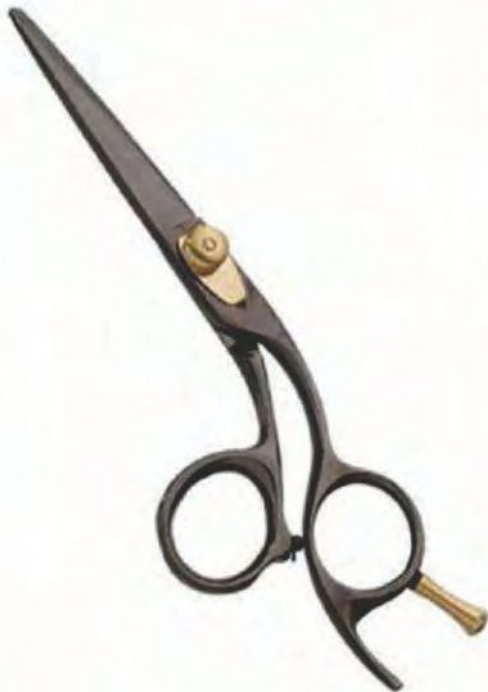
Professional Hair Cutting Scissor Titanium Coated Size: 5", 5.5", 6", 6.5"