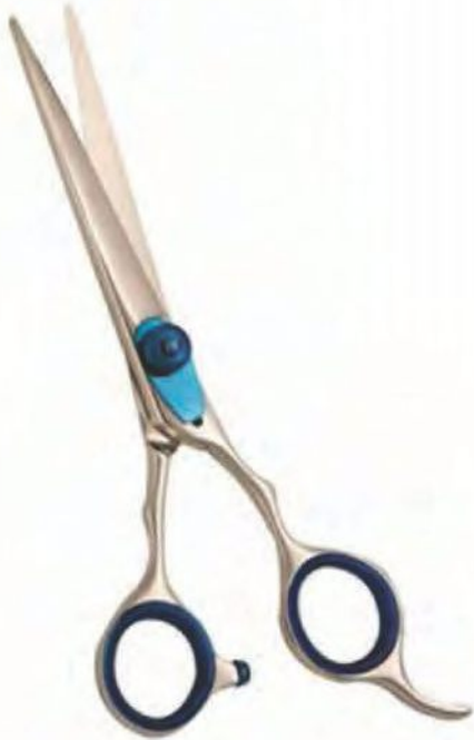
Professional Hair Cutting Scissor Size: 5", 5.5", 6", 6.5"