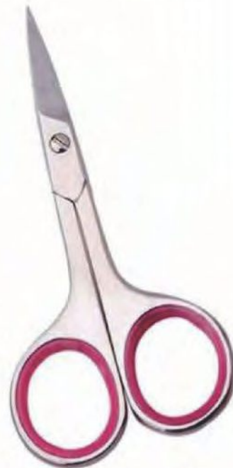
Cuticle Scissor Size: 9cm