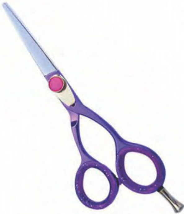
Professional Hair Cutting Scissor Titanium Coated Size: 5", 5.5", 6", 6.5"