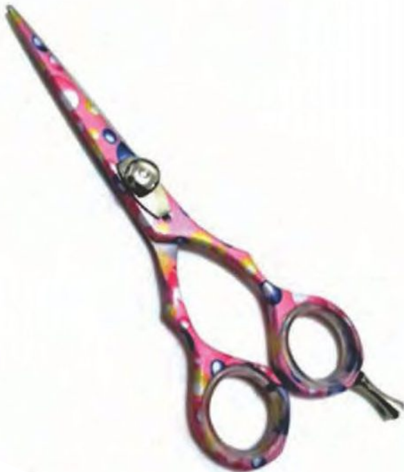
Professional Hair Cutting Scissor Paper Coated Size: 5", 5.5", 6", 6.5"