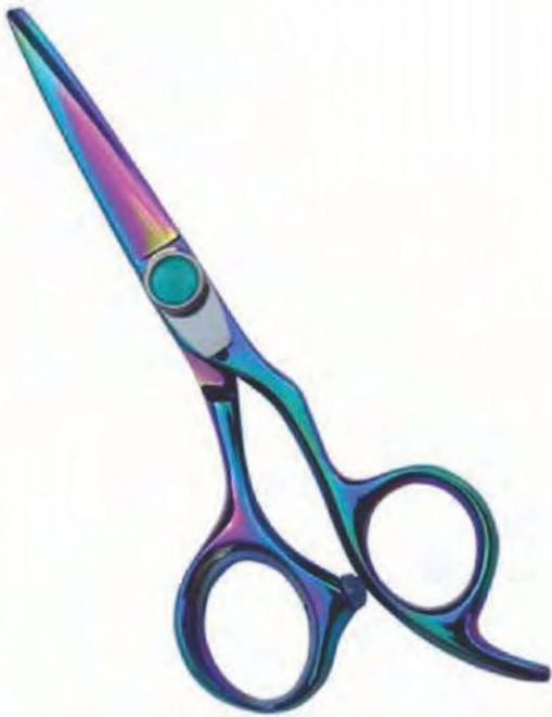
Professional Hair Cutting Scissor Multi Colored Size: 5", 5.5", 6", 6.5"