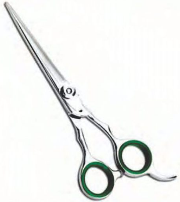
Professional Hair Cutting Scissor Size: 5", 5.5", 6", 6.5"