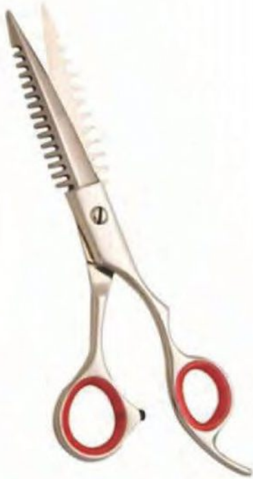
Fish Bone Style Professional Hair Cutting Scissor Size: 5", 5.5", 6", 6.5"