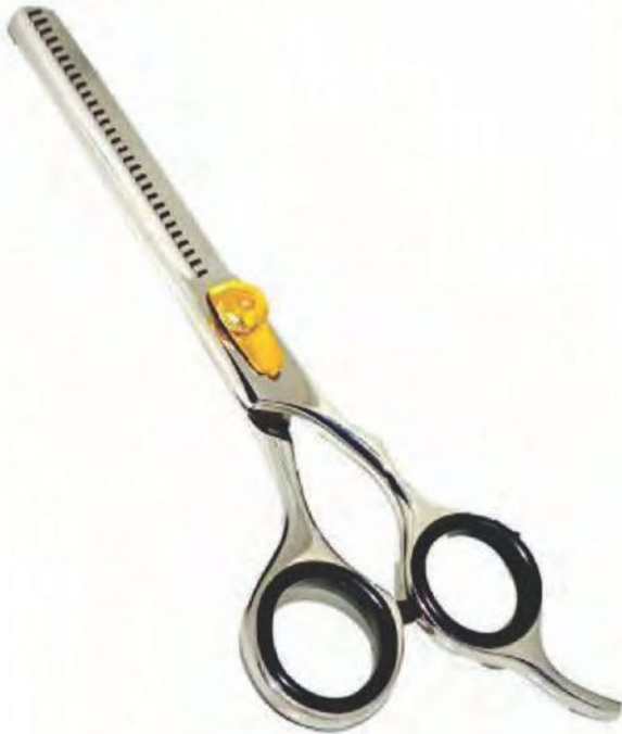
Professional Hair Thinning Scissor Size: 5", 5.5", 6", 6.5"