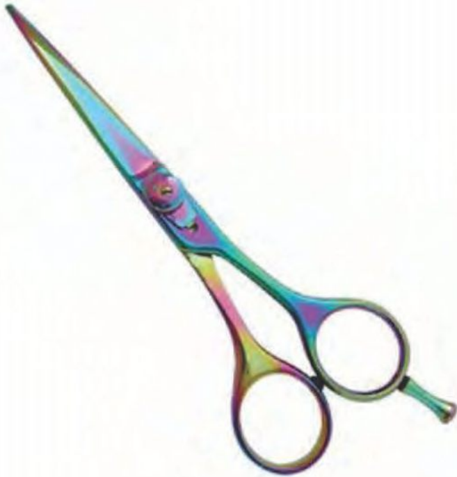
Professional Hair Cutting Scissor Paper Coated Size: 5", 5.5", 6", 6.5"