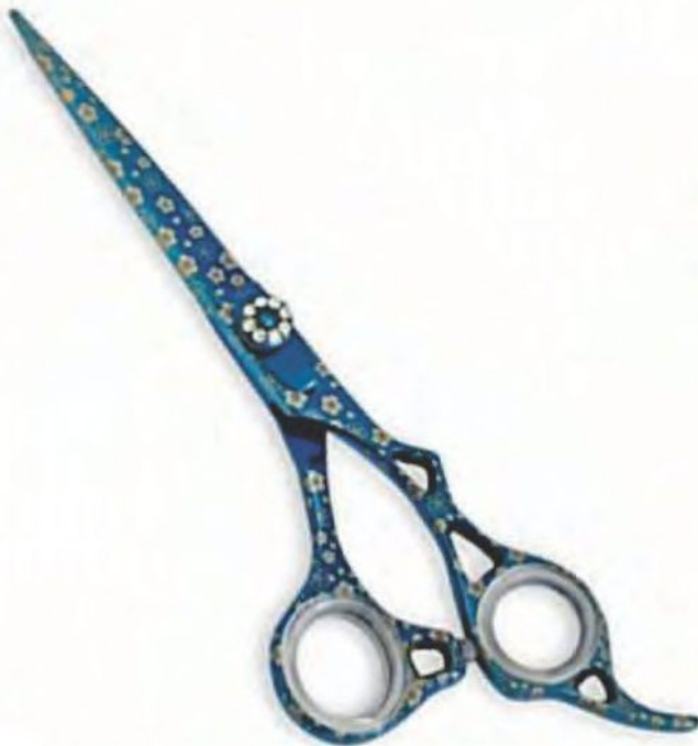
Professional Hair Cutting Scissor Paper Coated Size: 5", 5.5", 6", 6.5"