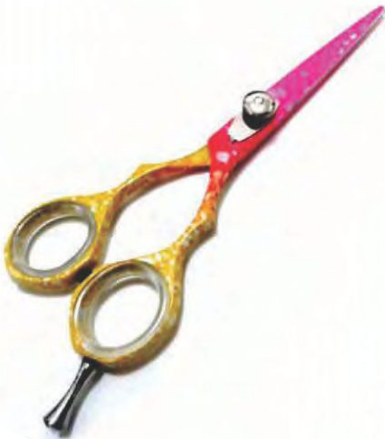
Professional Hair Cutting Scissor Paper Coated Size: 5", 5.5", 6", 6.5"