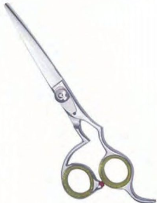
Professional Hair Cutting Scissor Size: 5", 5.5", 6", 6.5"