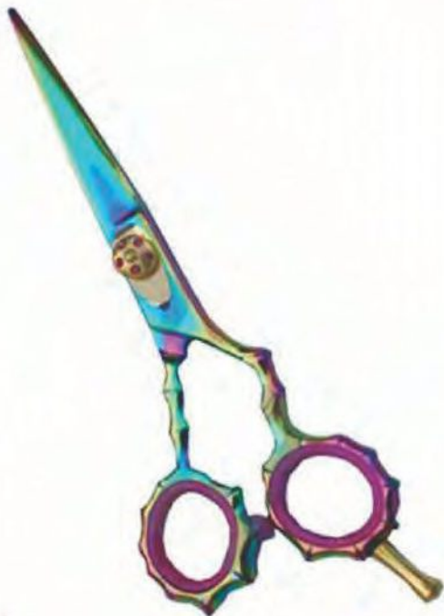
Star Professional Hair Cutting Scissor Multi Colored Size: 5", 5.5", 6", 6.5"