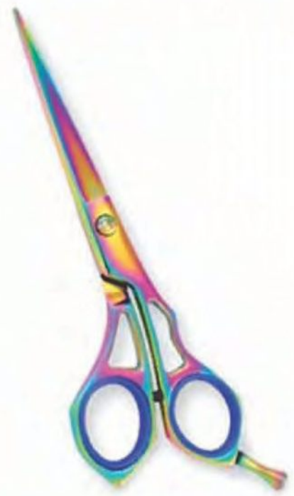
Professional Hair Cutting Scissor Multi Colored Size: 5", 5.5", 6", 6.5"