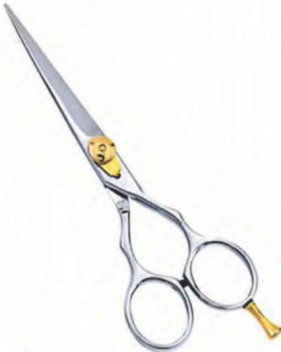
Professional Hair Cutting Scissor Size: 5", 5.5", 6", 6.5"