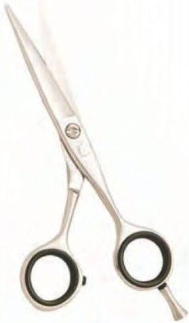
Professional Hair Cutting Scissor Size: 5", 5.5", 6", 6.5"