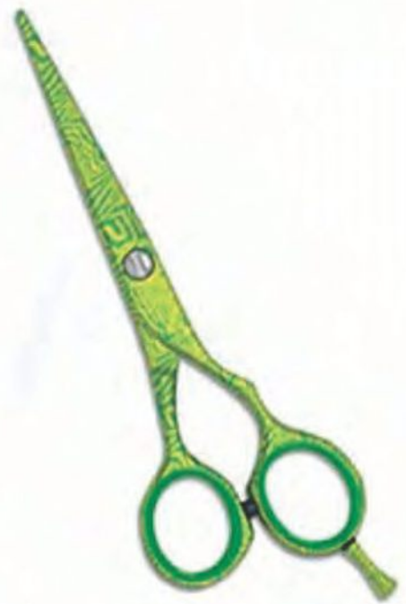
Professional Hair Cutting Scissor Paper Coated Size: 5", 5.5", 6", 6.5"