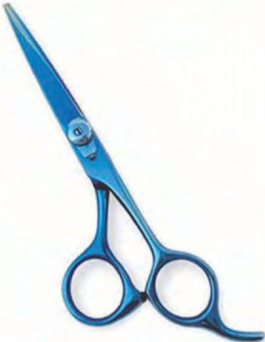
Professional Hair Cutting Scissor Titanium Coated Size: 5", 5.5", 6", 6.5"