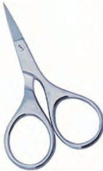
Cuticle Scissor Size: 6cm