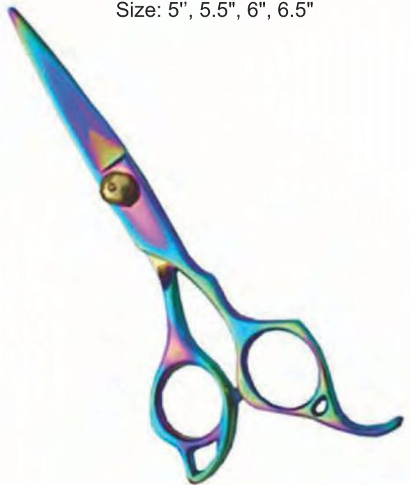
Professional Hair Cutting Scissor Multi Colored Size: 5", 5.5", 6", 6.5"