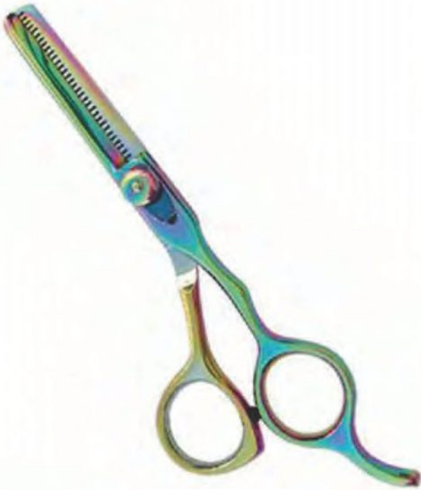
Professional Hair Thinning Scissor Multi Colored Size: 5", 5.5", 6", 6.5"