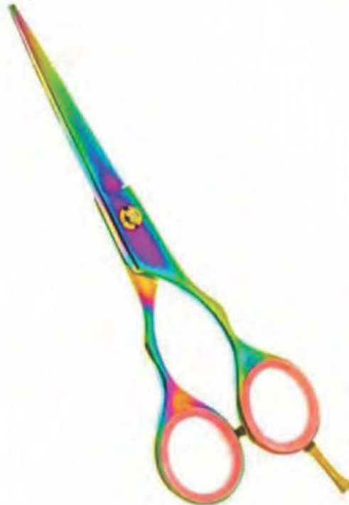
Professional Hair Cutting Scissor Multi Colored Size: 5", 5.5", 6", 6.5"