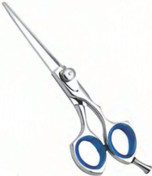
Professional Hair Cutting Scissor Size: 5", 5.5", 6", 6.5"