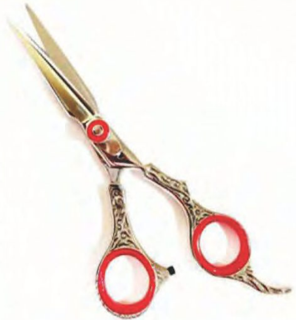
Professional Hair Cutting Scissor Paper Coated Size: 5", 5.5", 6", 6.5"