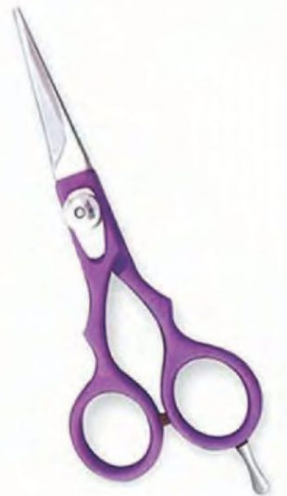
Professional Hair Cutting Scissor Paper Coated Size: 5", 5.5", 6", 6.5"