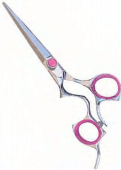
Professional Hair Cutting Scissor Size: 5", 5.5", 6", 6.5"