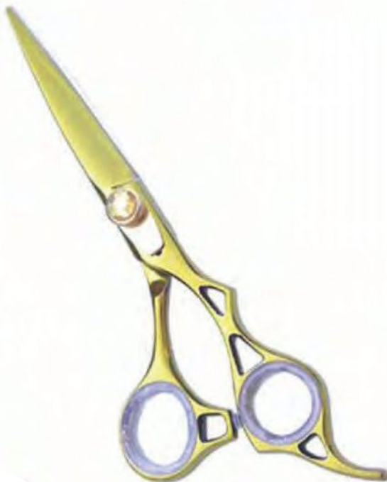
Professional Hair Cutting Scissor Titanium Coated Size: 5", 5.5", 6", 6.5"