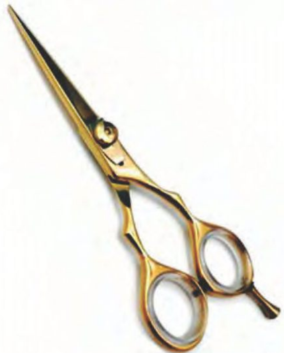
Professional Hair Cutting Scissor Gold Plated Size: 5", 5.5", 6", 6.5"