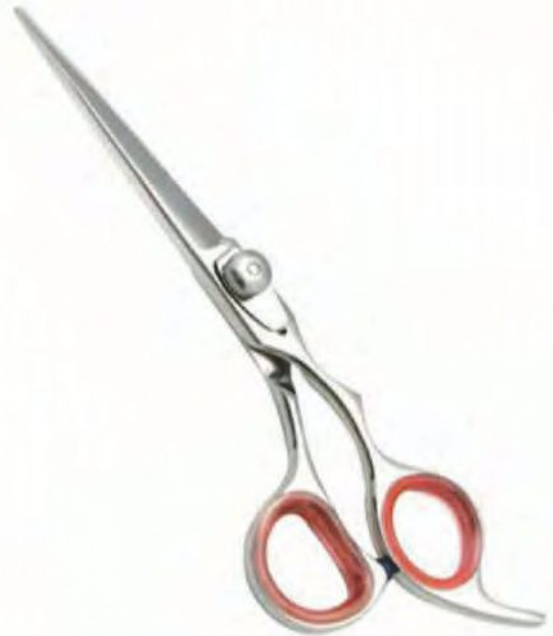
Professional Hair Cutting Scissor Size: 5", 5.5", 6", 6.5"