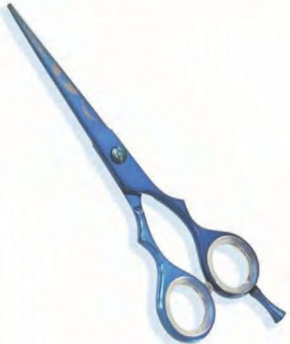
Professional Hair Cutting Scissor Titanium Coated Size: 5", 5.5", 6", 6.5"