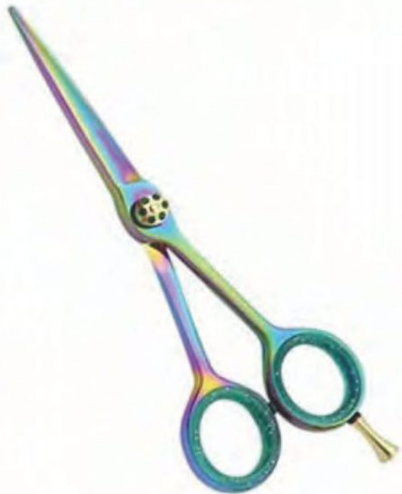
Professional Hair Cutting Scissor Multi Colored Size: 5", 5.5", 6", 6.5"