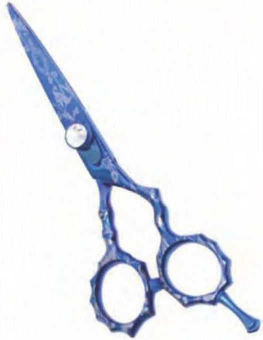
Star Professional Hair Cutting Scissor Paper Coated Size: 5", 5.5", 6", 6.5"