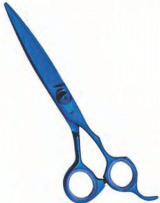
Professional Hair Cutting Scissor Titanium Coated Size: 5", 5.5", 6", 6.5"