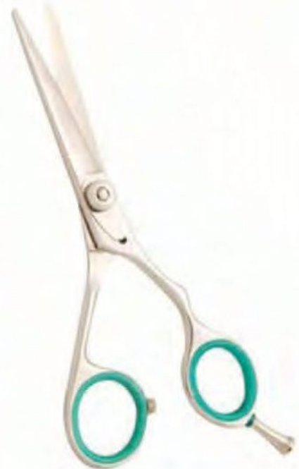
Professional Hair Cutting Scissor Size: 5", 5.5", 6", 6.5"