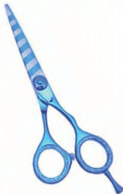
Professional Hair Cutting Scissor Paper Coated Size: 5", 5.5", 6", 6.5"