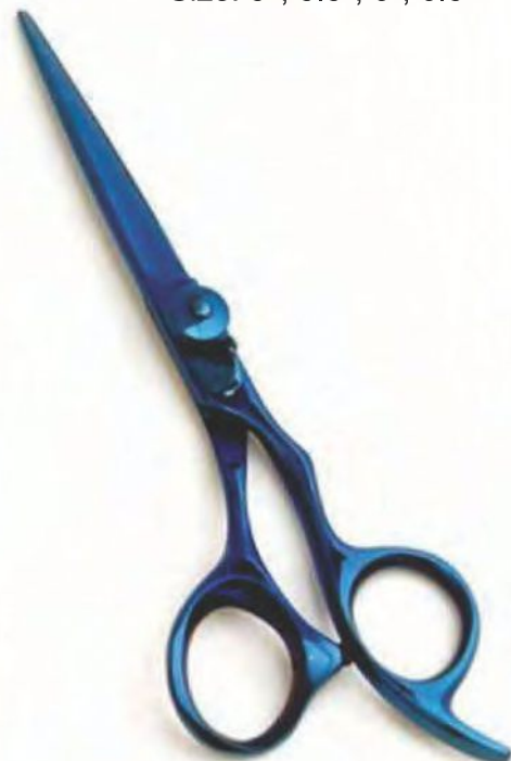
Professional Hair Cutting Scissor Titanium Coated Size: 5", 5.5", 6", 6.5"