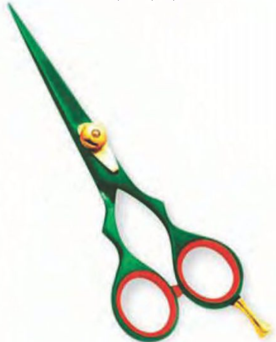
Professional Hair Cutting Scissor Paper Coated Size: 5", 5.5", 6", 6.5"