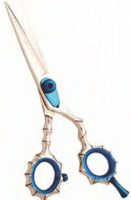
Star Professional Hair Cutting Scissor Size: 5", 5.5", 6", 6.5"