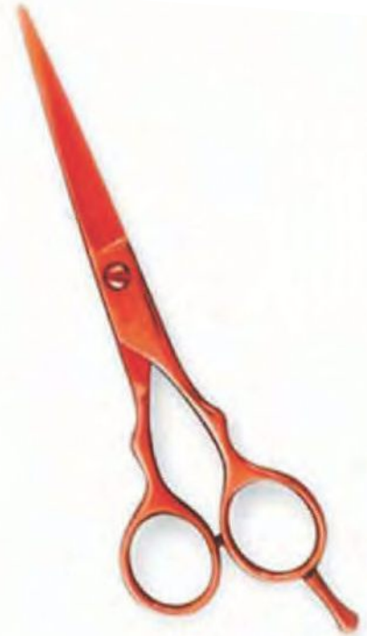
Professional Hair Cutting Scissor Titanium Coated Size: 5", 5.5", 6", 6.5"