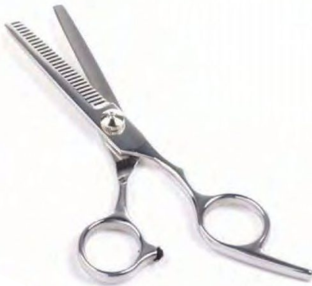
Professional Hair Thinning Scissor Size: 5", 5.5", 6", 6.5"