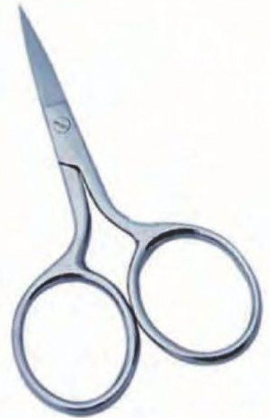
Cuticle Scissor Size: 6cm