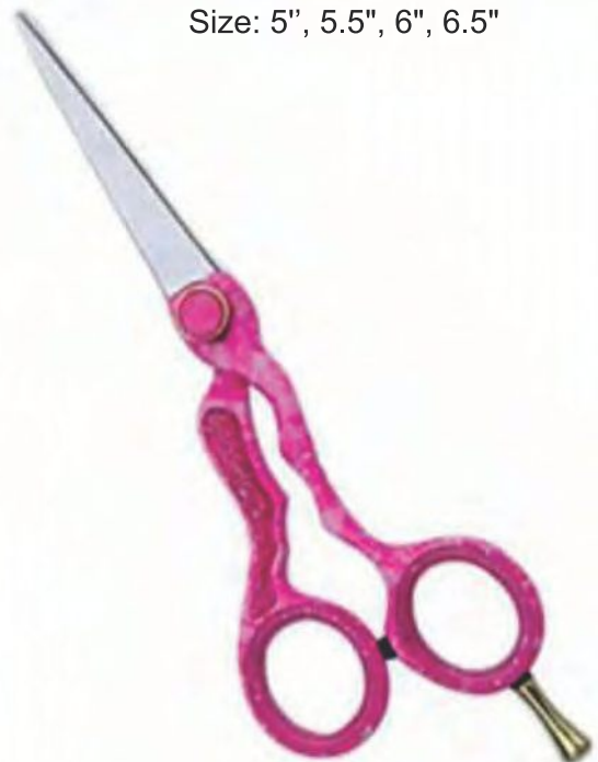
Professional Hair Cutting Scissor Size: 5", 5.5", 6", 6.5"