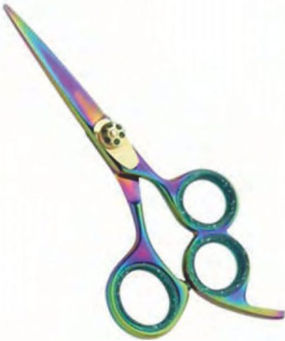
Professional Hair Cutting Scissor with Three Finger Holes Multi Colored Size: 5", 5.5", 6", 6.5"