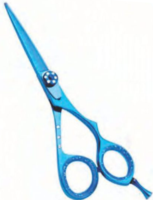
Professional Hair Cutting Scissor Titanium Coated Size: 5", 5.5", 6", 6.5"