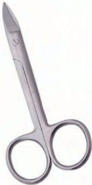
Toe Nail Scissor Size: 10cm