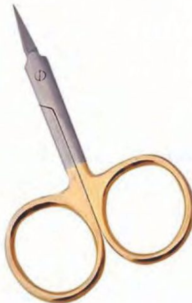
Arrow Point Cuticle Nail Scissor Size: 6cm