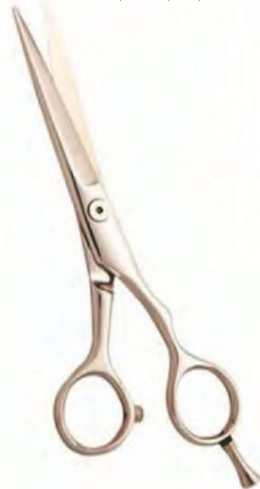
Revolving Thumb Hair Cutting Scissor Size: 5", 5.5", 6", 6.5"