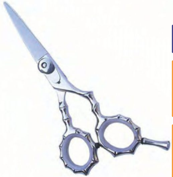
Star Professional Hair Cutting Scissor Size: 5", 5.5", 6", 6.5"