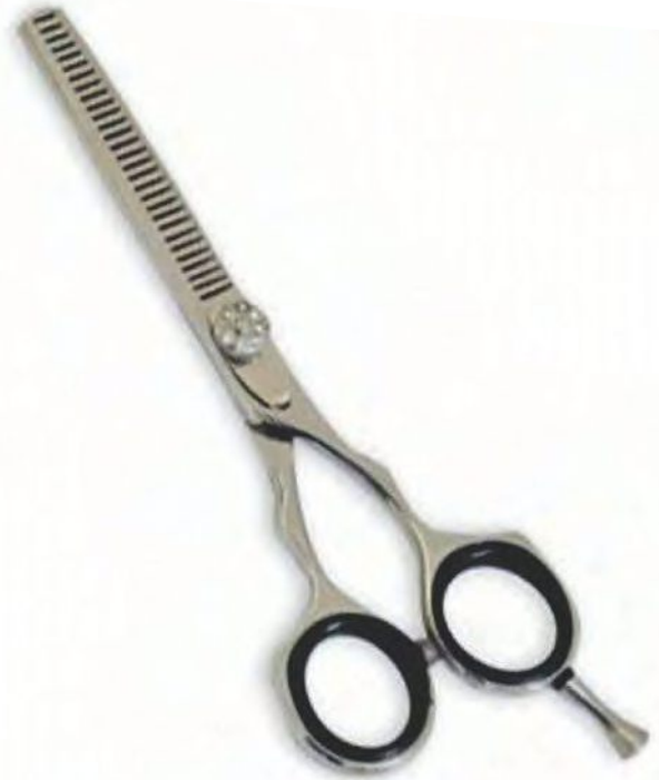
Professional Hair Thinning Scissor Size: 5", 5.5", 6", 6.5"