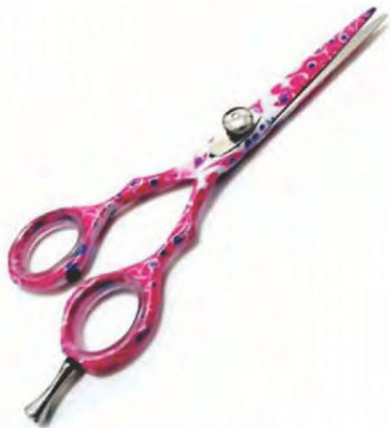
Professional Hair Cutting Scissor Paper Coated Size: 5", 5.5", 6", 6.5"