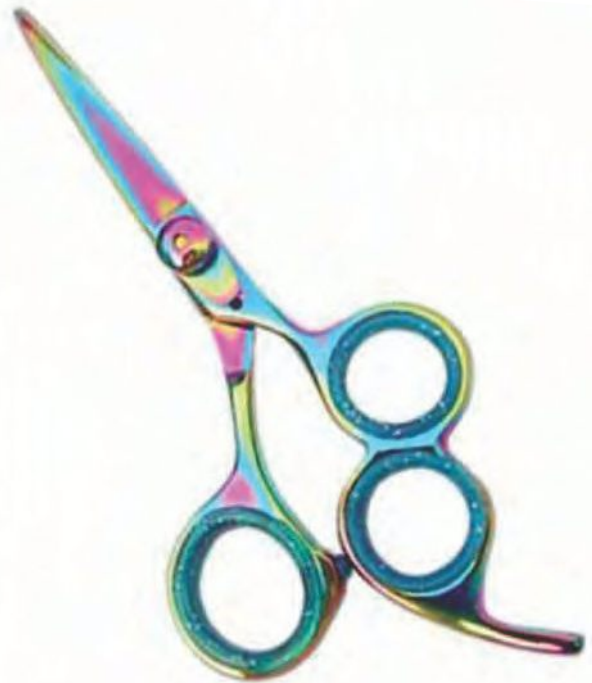
Professional Hair Cutting Scissor with Three Finger Holes Multi Colored Size: 5", 5.5", 6", 6.5"