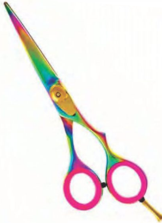
Professional Hair Cutting Scissor Multi Colored Size: 5", 5.5", 6", 6.5"