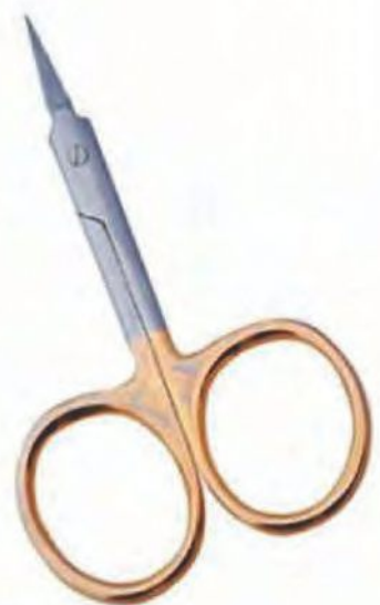
Arrow Point Cuticle Nail Scissor Size: 6cm