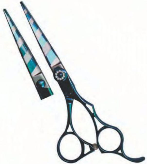
Professional Hair Cutting Scissor Titanium Coated Size: 5", 5.5", 6", 6.5"