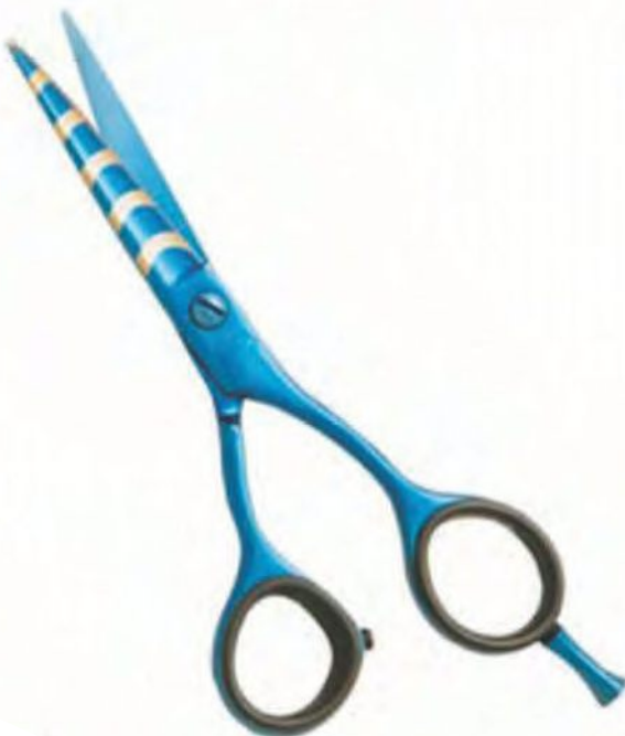
Professional Hair Cutting Scissor Paper Coated Size: 5", 5.5", 6", 6.5"