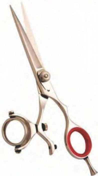
Revolving Thumb Hair Cutting Scissor Size: 5", 5.5", 6", 6.5"