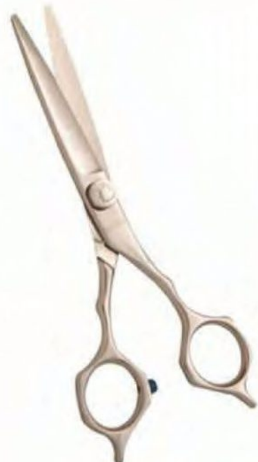
Star Professional Hair Cutting Scissor Size: 5", 5.5", 6", 6.5"