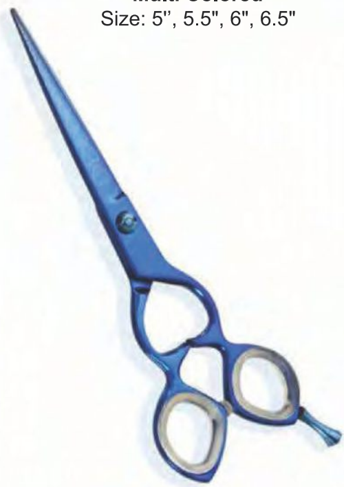
Professional Hair Cutting Scissor Paper Coated Size: 5", 5.5", 6", 6.5"