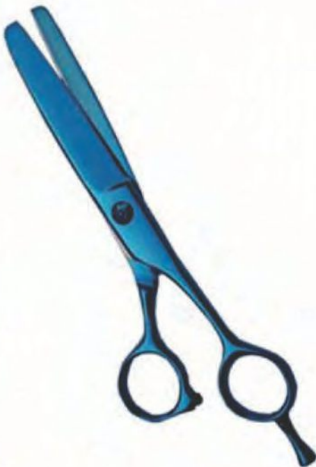
Professional Hair Cutting Scissor Titanium Coated Size: 5", 5.5", 6", 6.5"