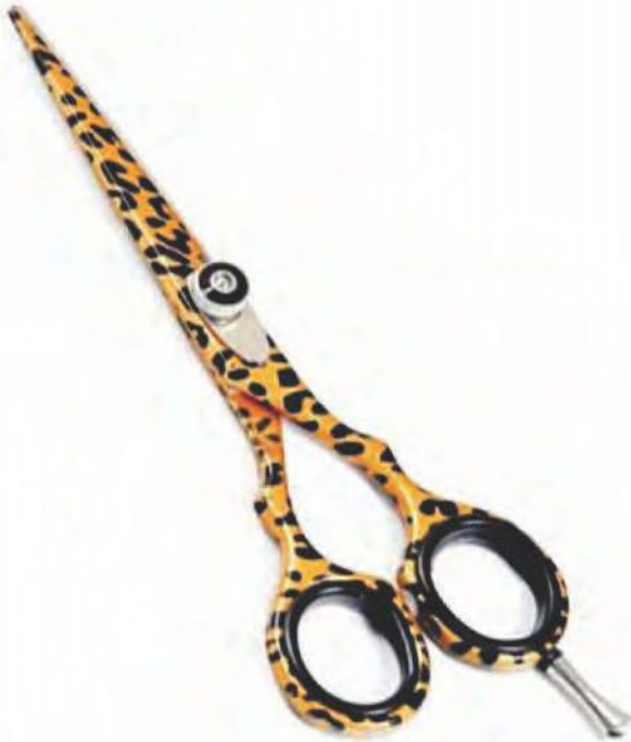
Professional Hair Cutting Scissor Paper Coated Size: 5", 5.5", 6", 6.5"