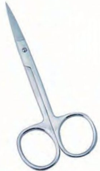
Cuticle Scissor Size: 9cm