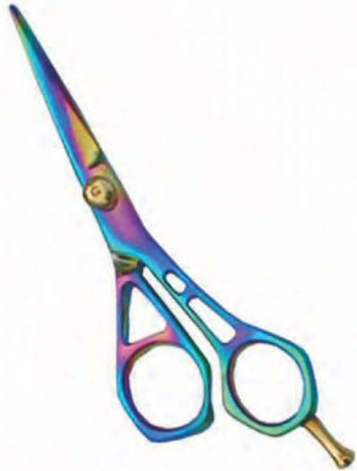
Professional Hair Cutting Scissor Multi Colored Size: 5", 5.5", 6", 6.5"