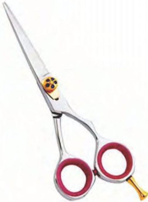
Professional Hair Cutting Scissor Size: 5", 5.5", 6", 6.5"