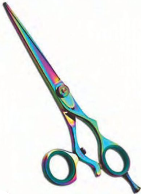
Professional Hair Cutting Scissor Multi Colored Size: 5", 5.5", 6", 6.5"