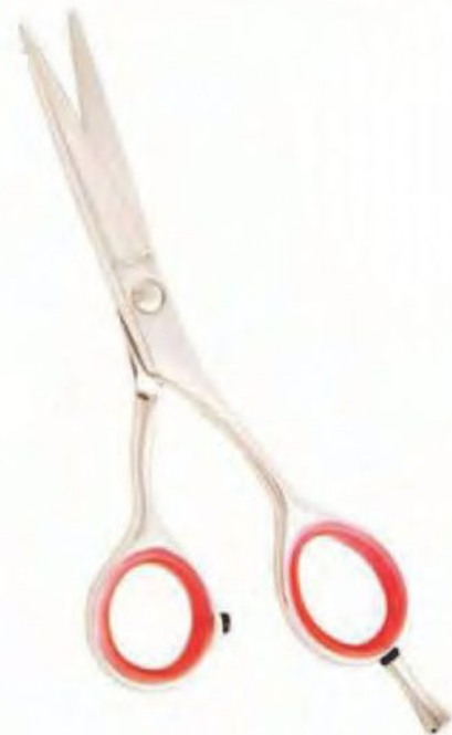
Professional Hair Cutting Scissor Size: 5", 5.5", 6", 6.5"