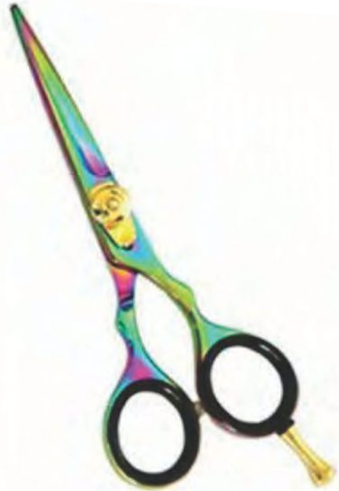
Professional Hair Cutting Scissor Multi Colored Size: 5", 5.5", 6", 6.5"