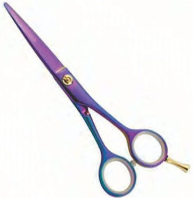
Professional Hair Cutting Scissor Paper Coated Size: 5", 5.5", 6", 6.5"