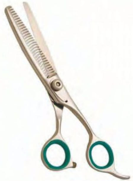
Professional Hair Thinning Scissors Size: 5", 5.5", 6", 6.5"