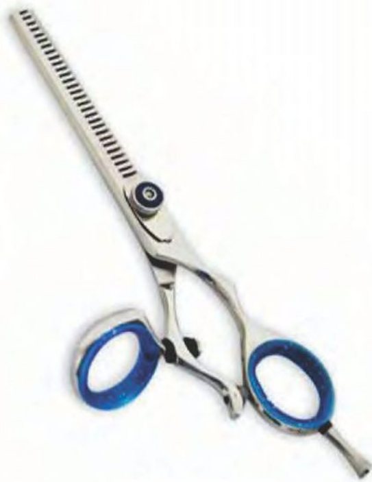
Revolving Thumb Hair Thinning Scissor Size: 5", 5.5", 6", 6.5"