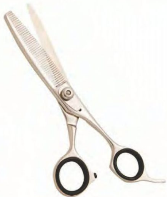
Professional Hair Thinning Scissors Size: 5", 5.5", 6", 6.5"