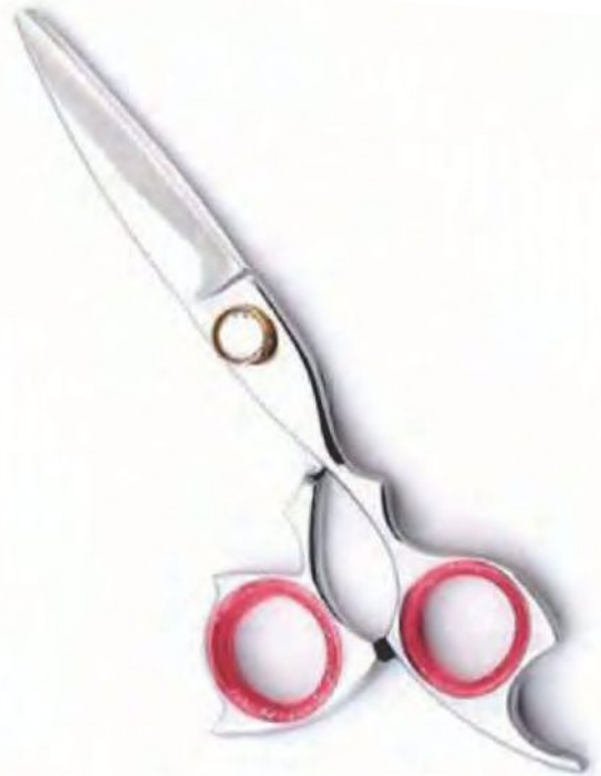
Professional Hair Cutting Scissor Size: 5", 5.5", 6", 6.5"