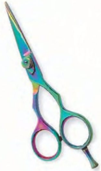
Professional Hair Cutting Scissor Multi Colored Size: 5", 5.5", 6", 6.5"