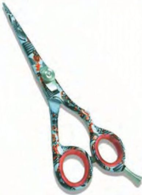
Professional Hair Cutting Scissor Paper Coated Size: 5", 5.5", 6", 6.5"