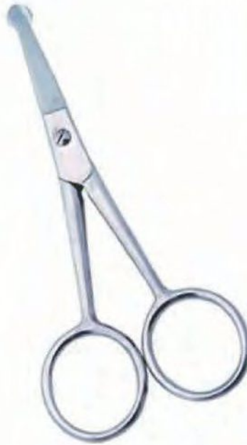
Safety Scissor Size: 9cm