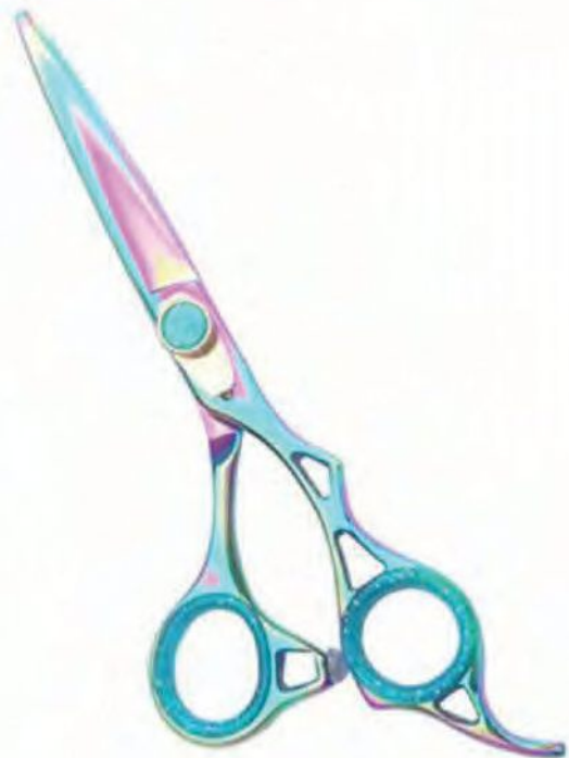
Professional Hair Cutting Scissor Multi Colored Size: 5", 5.5", 6", 6.5"