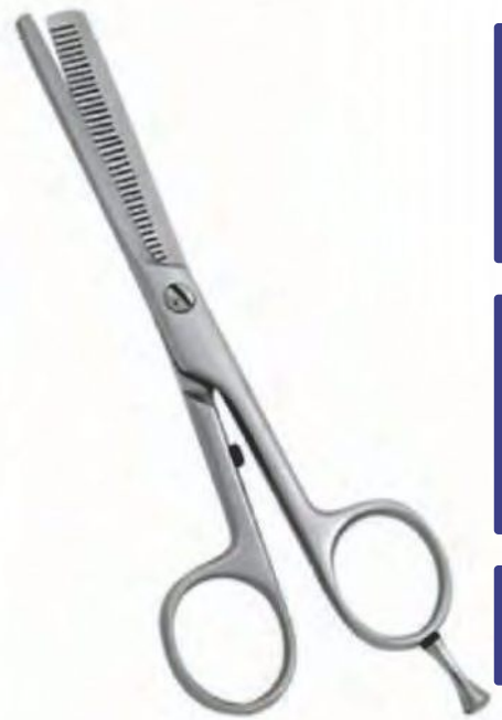
Professional Hair Thinning Scissors Size: 5", 5.5", 6", 6.5"