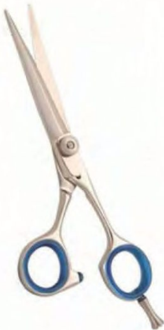
Professional Hair Cutting Scissor Size: 5", 5.5", 6", 6.5"