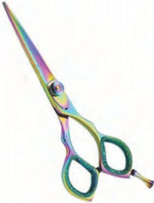
Professional Hair Cutting Scissor Multi Colored Size: 5", 5.5", 6", 6.5"