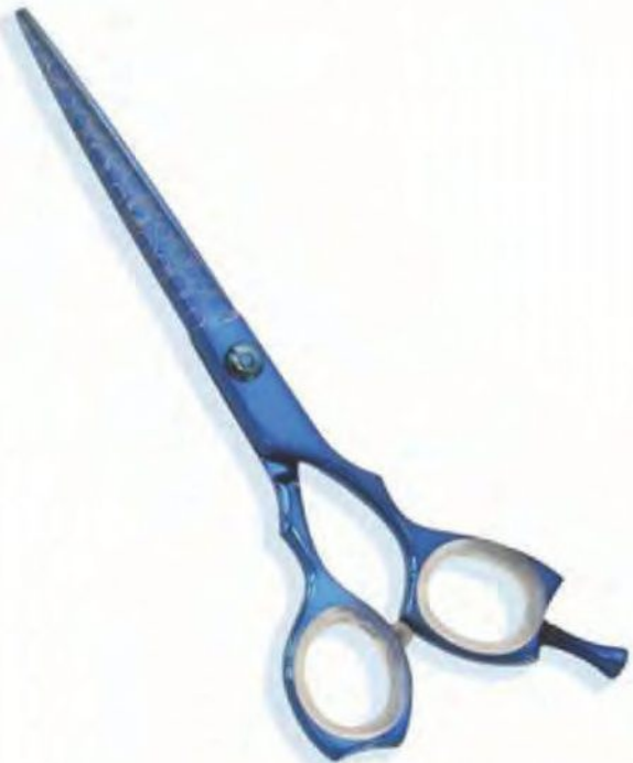
Professional Hair Cutting Scissor Titanium Coated Size: 5", 5.5", 6", 6.5"