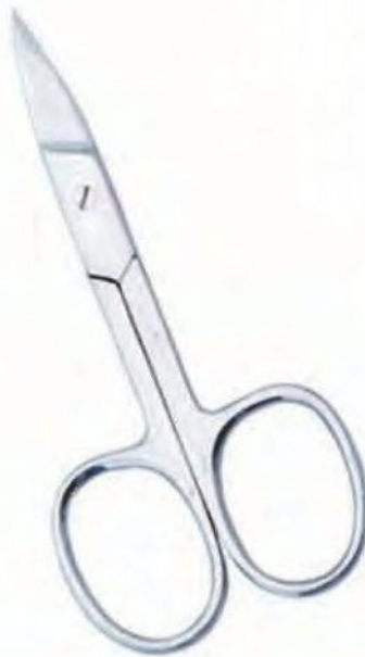
Cuticle Scissor Size: 9cm