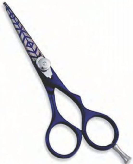
Professional Hair Cutting Scissor Multi Colored Size: 5", 5.5", 6", 6.5"