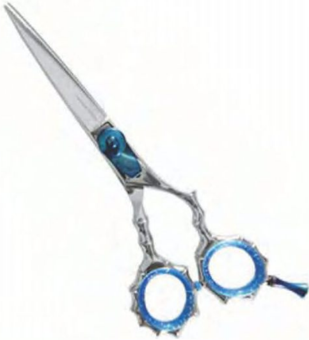
Star Professional Hair Cutting Scissor Size: 5", 5.5", 6", 6.5"