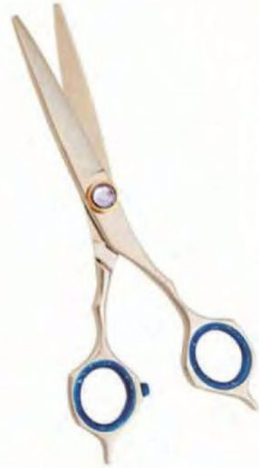
Star Professional Hair Cutting Scissor Size: 5", 5.5", 6", 6.5"