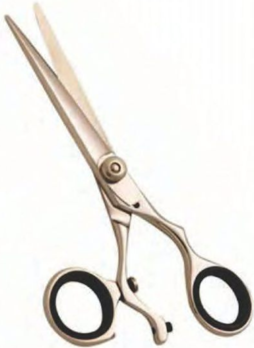
Revolving Thumb-Hair Cutting Scissor Size: 5", 5.5", 6", 6.5"