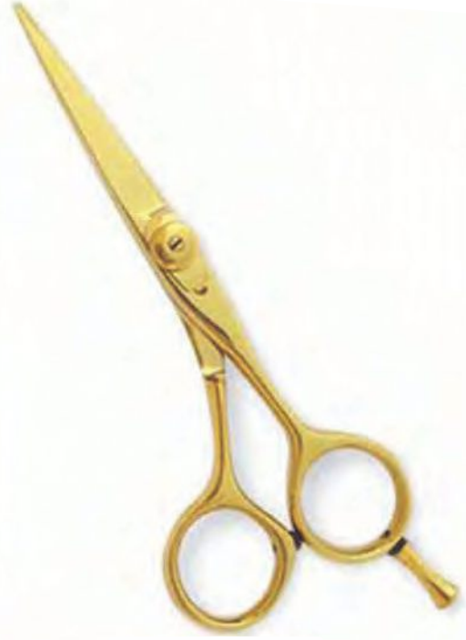
Professional Hair Cutting Scissor Gold Plated Size: 5", 5.5", 6", 6.5"