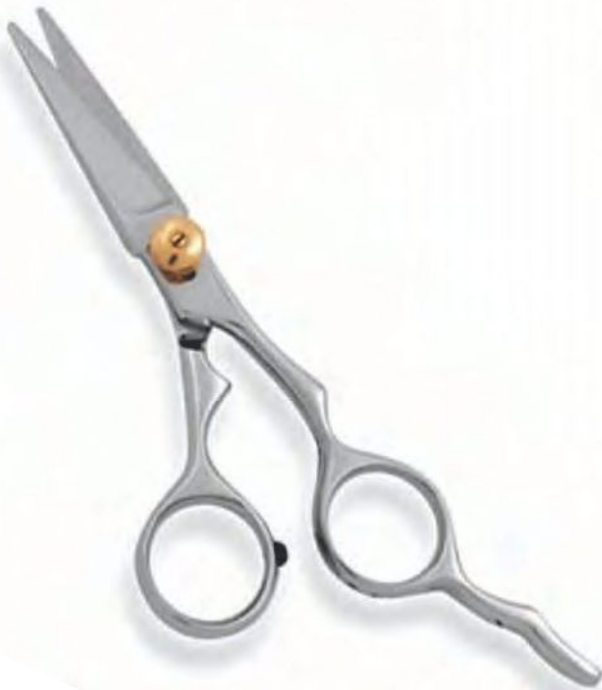
Professional Hair Cutting Scissor Size: 5", 5.5", 6", 6.5"