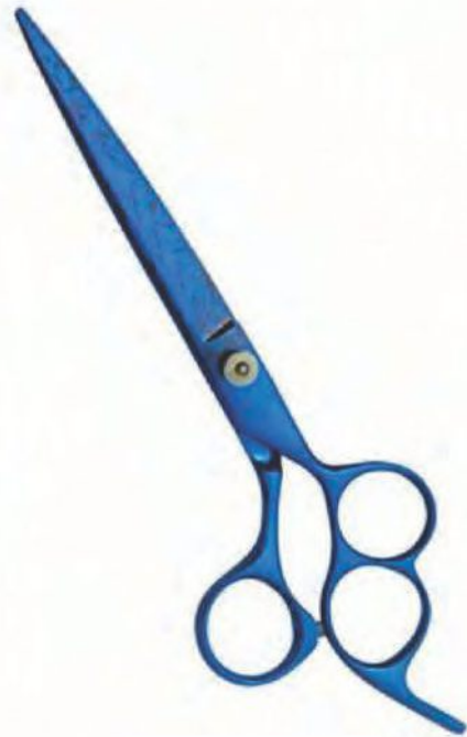
Professional Hair Cutting Scissor with Three Finger Holes Multi Colored Size: 5", 5.5", 6", 6.5"