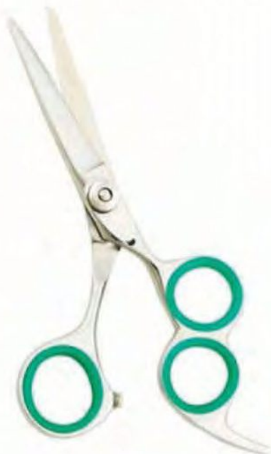
Professional Hair Cutting Scissor with Three Finger Holes Size: 5", 5.5", 6", 6.5"