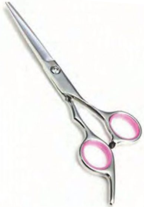
Professional Hair Cutting Scissor Multi Colored Size: 5", 5.5", 6", 6.5"