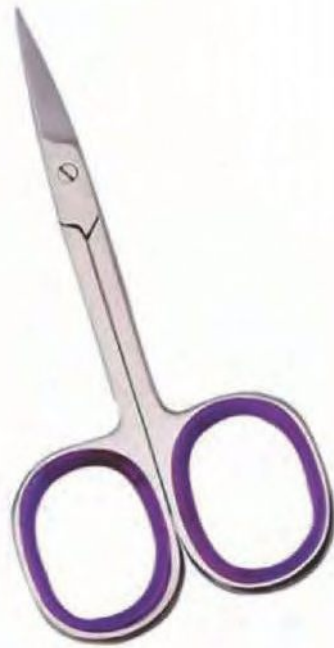
Cuticle Scissor Size: 9cm