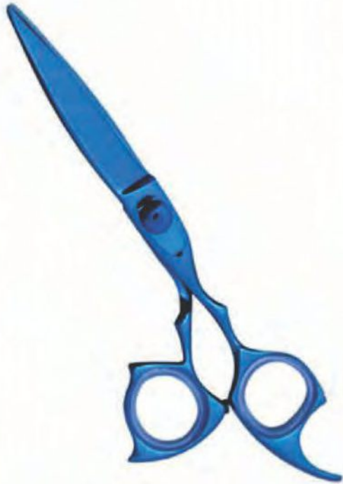
Professional Hair Cutting Scissor Titanium Coated Size: 5", 5.5", 6", 6.5"