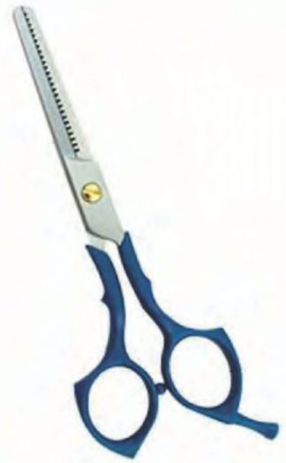
Barber Thinning Scissors with Finger Res Plastic Handles Size: 5", 5.5", 6", 6.5"